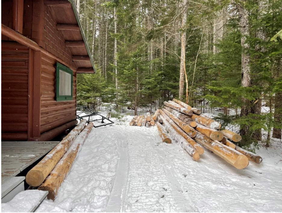
Logs staged at Daicey Pond Cabin 1

logs cut to length and staged at the more difficult-to-access cabin locations. Over 60 logs ranging in length from 16 to 36 feet were moved by snowmobile in 2 days just before the untimely snowmelt.