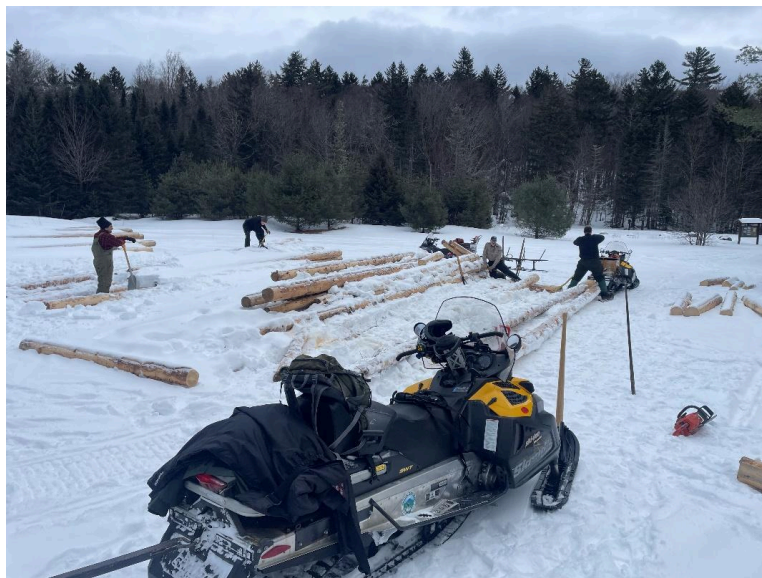
Preparing logs to be hauled to cabin locations at Daicey Pond