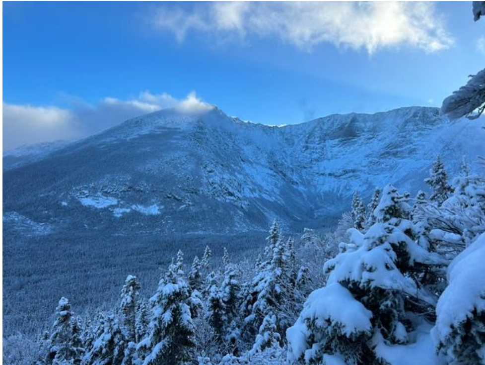
View from Hamlin Trail by Winter Ranger Jen Sinsabaugh.