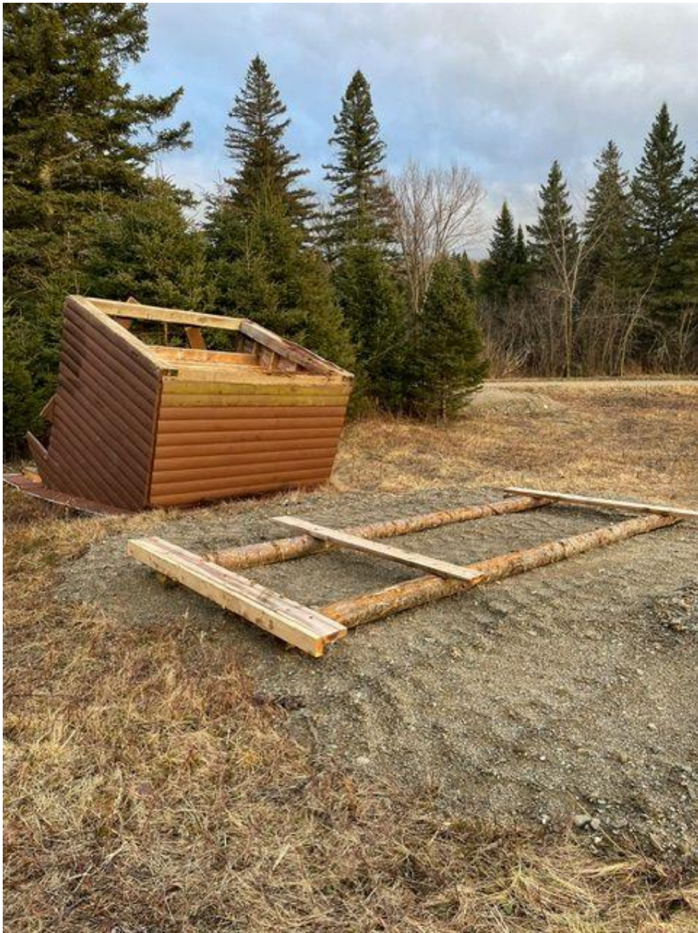
Lean-to at Nesowadnehunk Campground.