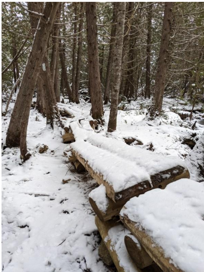
Grassy Pond Boardwalk

Most trails weathered the storm. There was some damage to the Boardwalk at Grassy Pond. We are advising hikers to take the Blueberry Ledges Trail until this issue is resolved, which is set for early summer 2024.