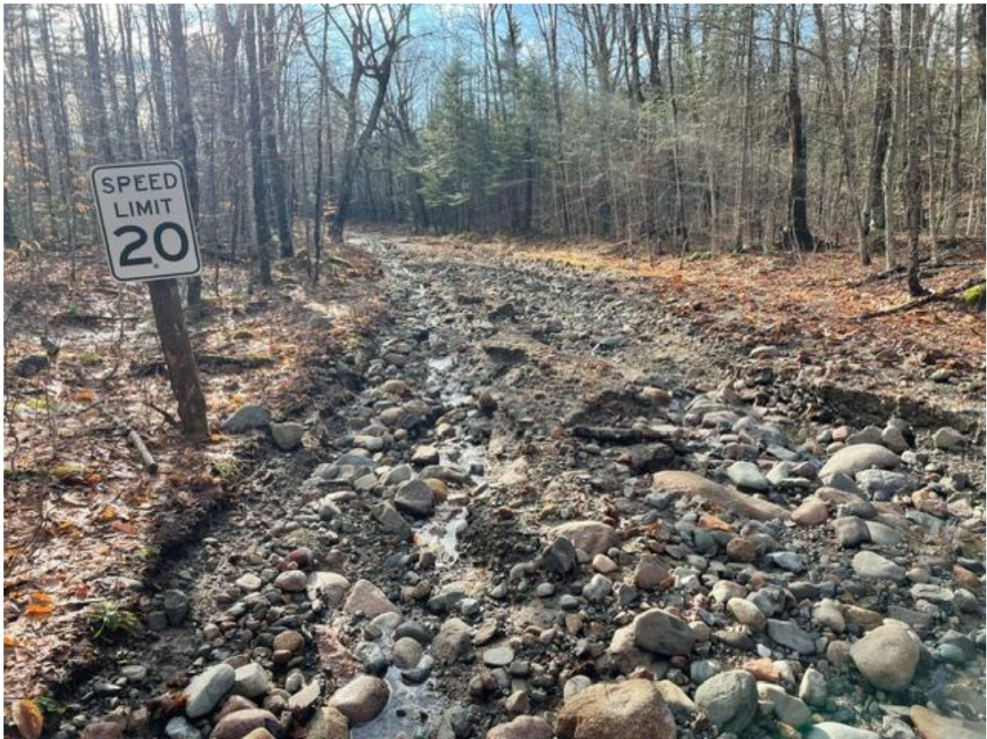
Katahdin Stream near Birches